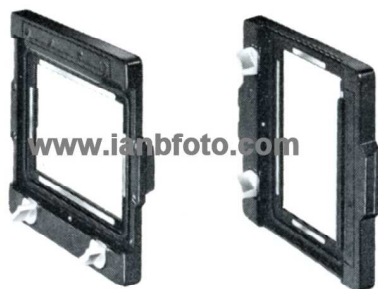
M adapter (horizontal)