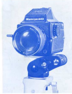
Printed in Japan